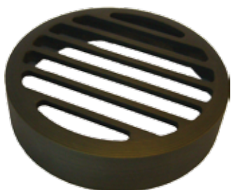
UC2951WB - Cast Brass UC2961WB - Stamped Brass UC1951AZ - Cast Aluminum