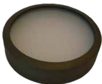
UC2950WB - Cast Brass UC2960WB - Stamped Brass UC1950AZ - Cast Aluminum