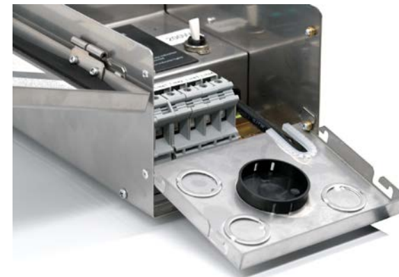
TOOL-LESS DROP-DOWN PANEL